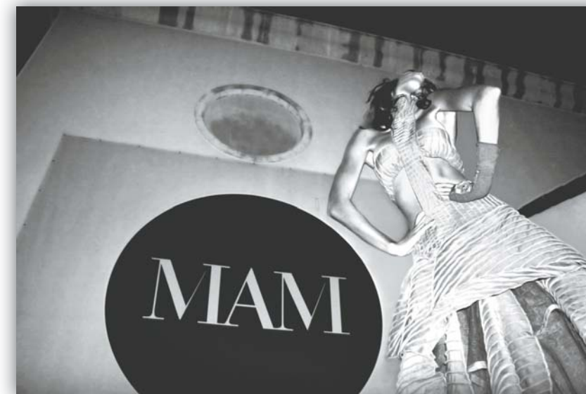
AUG. 21, 2008: “ART OF SHADE DOES MAM”