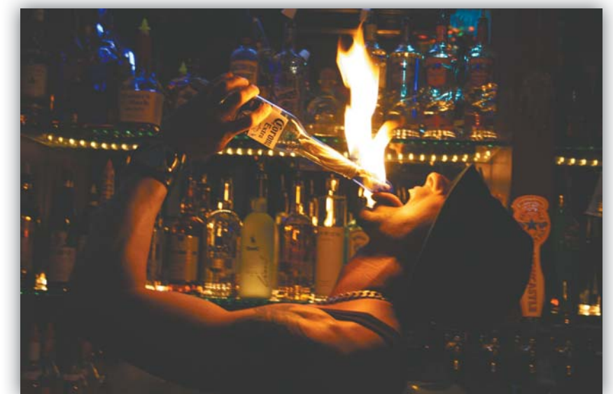
MARCH 12, 2008: “PYRO”