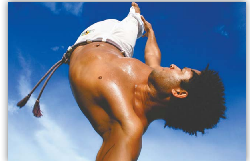
SEPT. 7: “CAPOEIRA : ESQUILO”