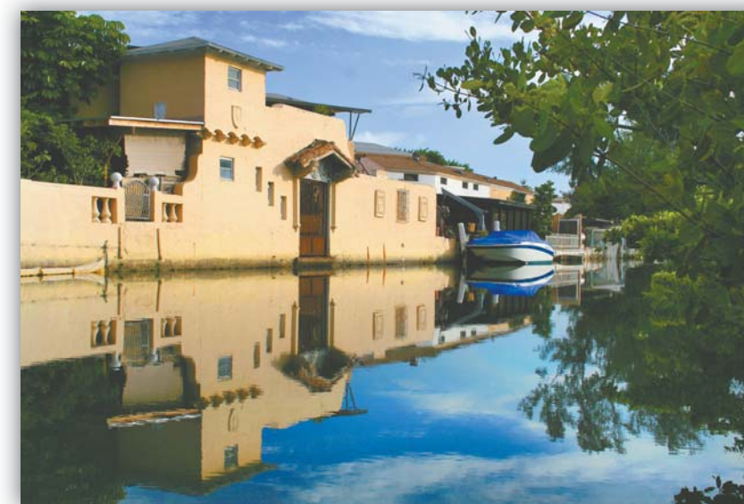
JUNE 16, 2008: “HOUSE ON THE WATER”