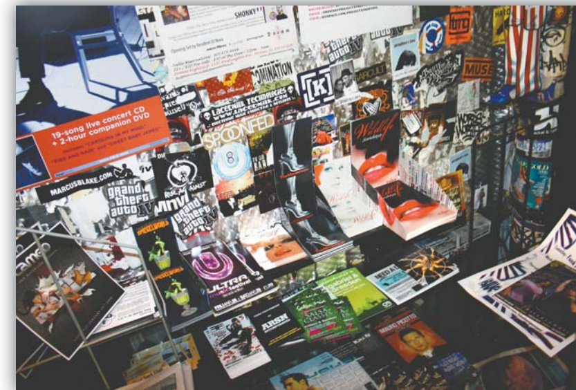
JAN. 17, 2008: “UNCLE SAM’S FLYER COLLECTION”