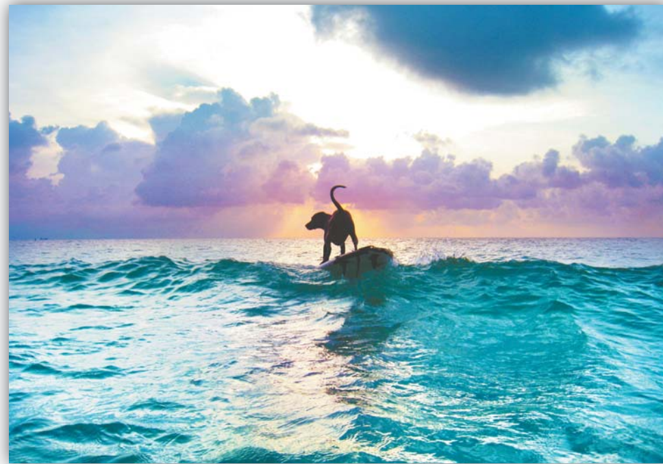
AUG. 20, 2008: “BOOKER THE SURF DOG FROM CALI”

EM: You shot at least one impressive new photo each day for a year for your ‘I Love Miami 365’ project without ‘cheating.’ Were there ever days when you just were not getting something up to your standards,