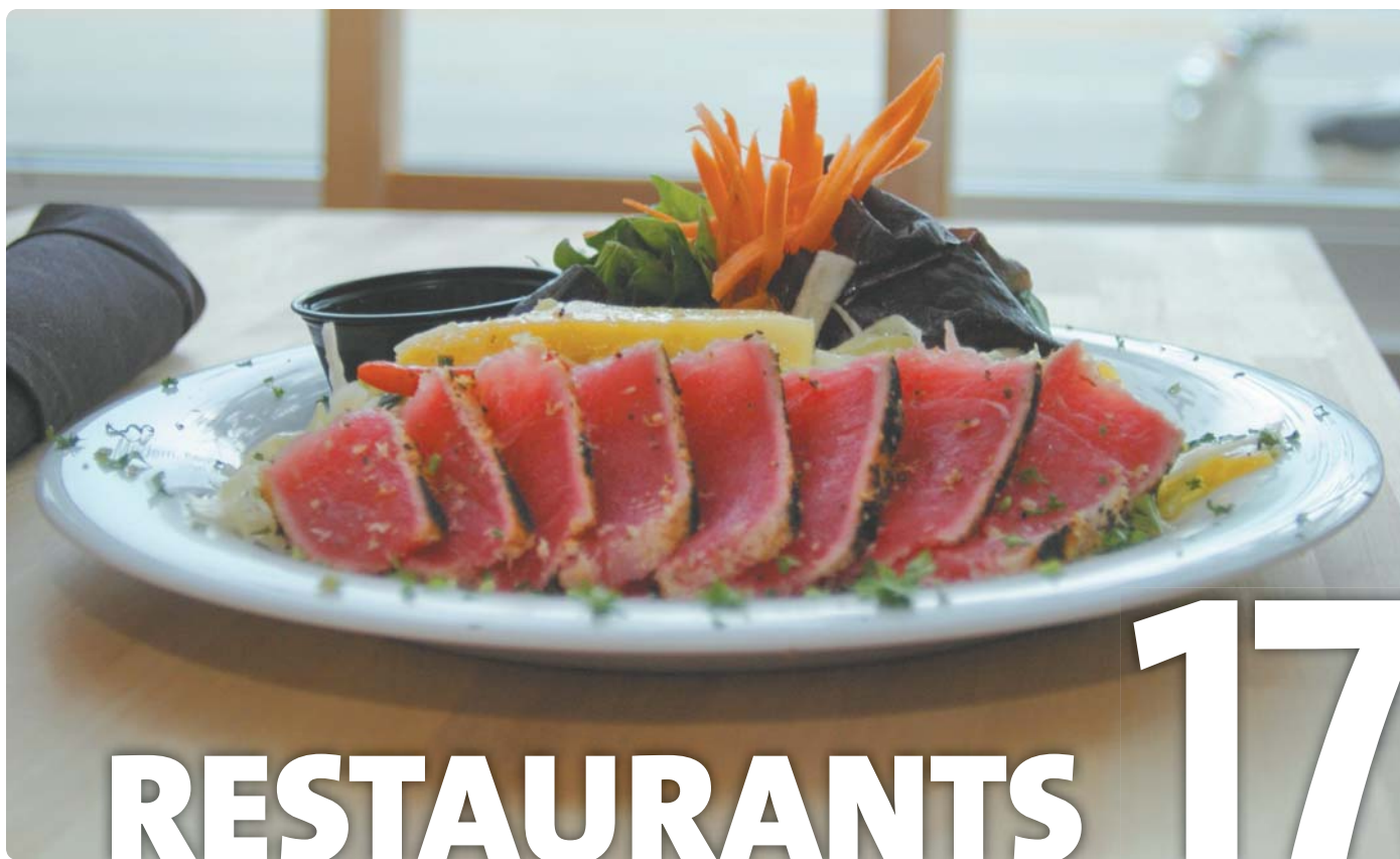
BERNIE'S L.A. CAFE

SUBSCRIPTION INQUIRIES / CUSTOMER SERVICE: ADMIN@THELEADMAMIIBEACH.COM